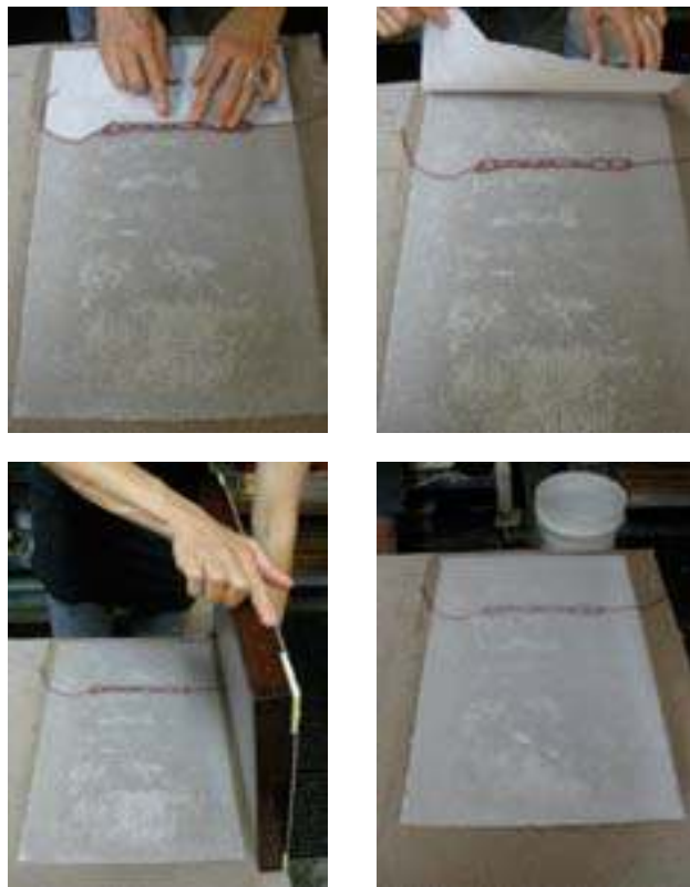
Top Left: positioning the string drawing on top of a freshly made sheet of abaca; Top Right: removing the jig; Bottom Left: couching a second layer of abaca, sandwiching the string between the two sheets; Bottom Right: the wet sheet of paper, ready to be pressed and dried.

Artist Statement: Threads are a frequent feature in my work, sometimes functioning as sculptural elements, sometimes embedded in sheets of paper or used to stitch or tie paper components together, and often creating metaphors for the physical, emotional and spiritual connections between people.